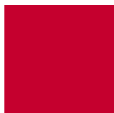
Aquarius™ Red B Concentrate