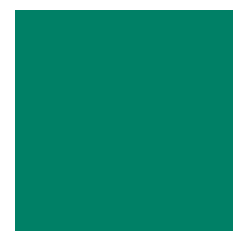
Aquarius™ Green Concentrate