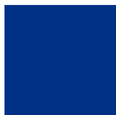
Aquarius™ Blue R Concentrate