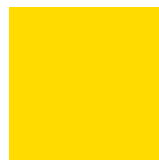
Aquarius™ Yellow G Concentrate