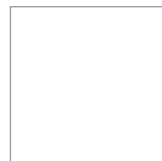
Aquarius™ White Concentrate