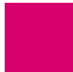
Aquarius™ Magenta Concentrate