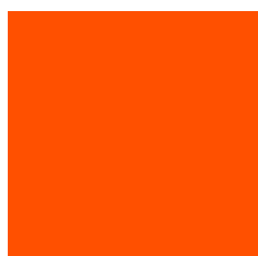
Aquarius™ Orange Concentrate